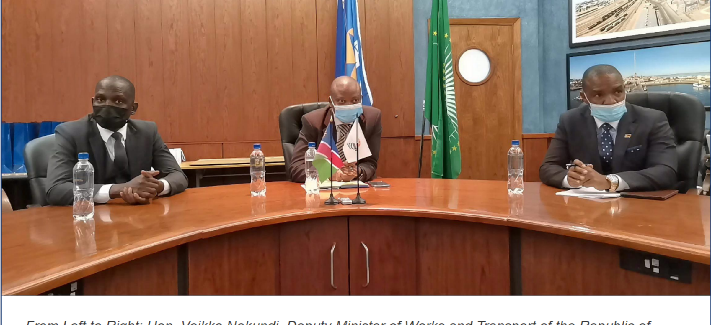
From Left to Right: Hon. Veikko Nekundi, Deputy Minister of Works and Transport of the Republic of Namibia, Mr Andrew Kanime, Namport CEO and Hon. Felix Mhona, Minister of Transport and Infrastructure Development of the Republic of Zimbabwe

The Minister of Transport and Infrastructure Development of the Republic of Zimbabwe, Hon. Felix Mhona recently paid a courtesy visit to the Namibian Ports Authority.