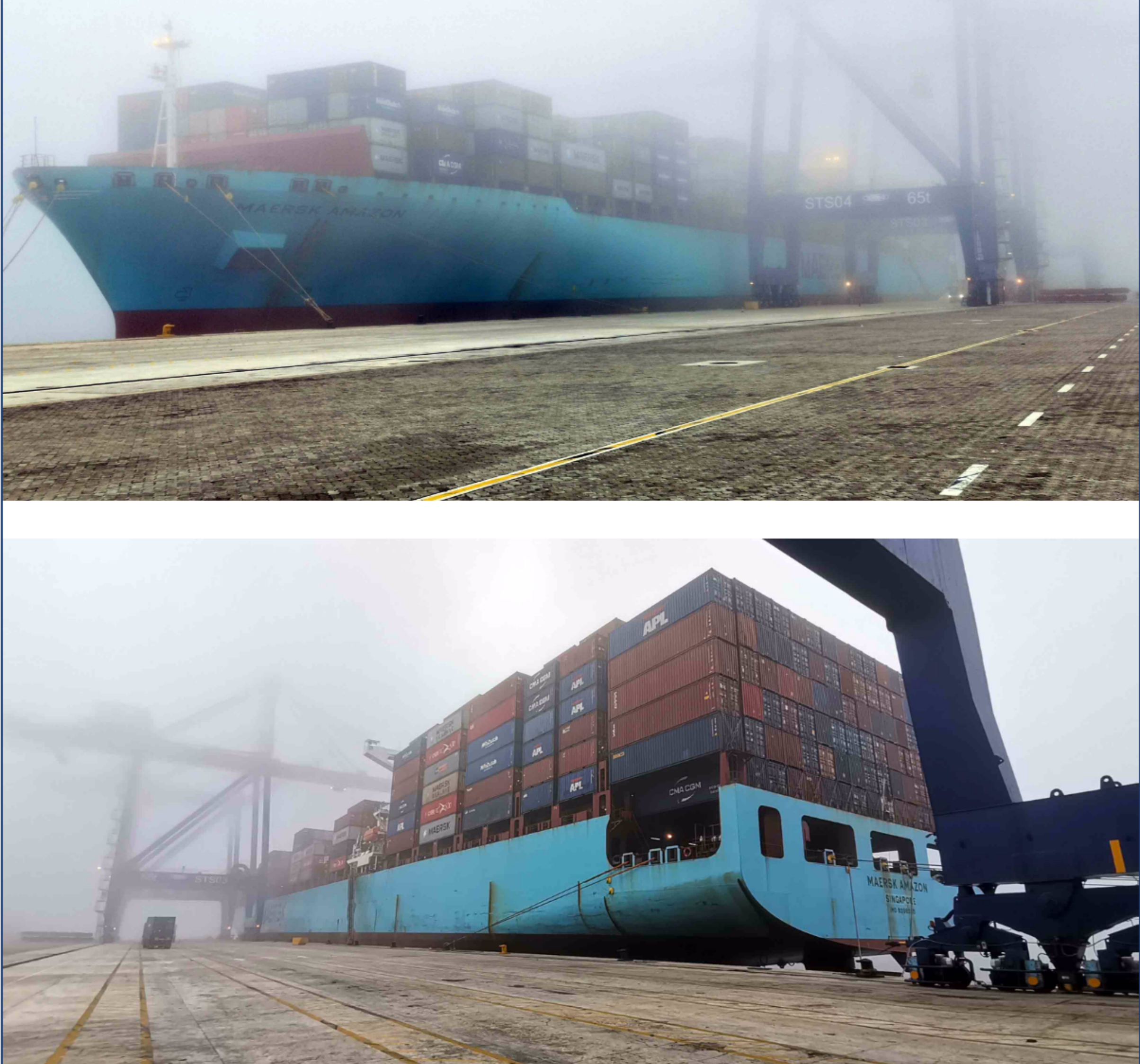
The Maersk Amazon docked along the quayside at the new container terminal at the Port of Walvis Bay

The Namibian Ports Authority earlier this week received the 334 meters long Maersk Amazon. The vessel docked late on Monday, 31 May 2021, in very foggy and windy weather at the Port of Walvis Bay.